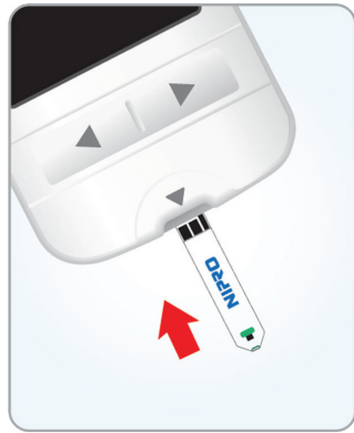
Insert a test