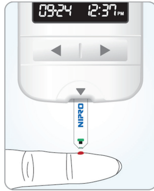
Apply blood sample