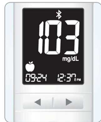
Result in 5 seconds